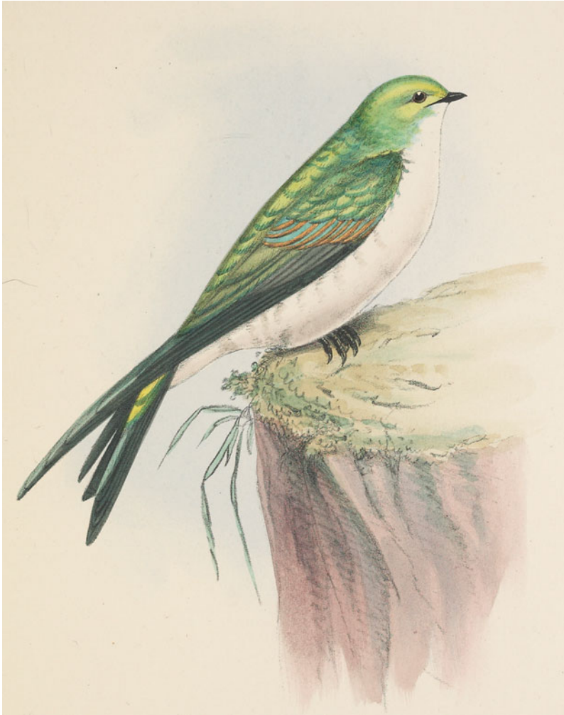
Figure 1. Lithograph of Golden Swallow from Plate 12 of Illustrations of the Birds of Jamaica (Gosse 1849).

road safety, cultural sensitivity, good sight lines, and distance from other census sites (minimum distance > 0.7 km). Census sites were located along paved roads, unimproved roads accessible with four-wheel drive vehicles, and along foot trails. Surveyed habitat included wet limestone forest, dry limestone forest, lower montane rain forest, mangrove forest, residential gardens and orchards, shaded coffee plantations, pasturelands with scattered old growth trees, church yards, ruinant woodland, and patchworks of secondary woodland, sugar cane, banana and coconut plantations, bamboo, agricultural scrub, and pasture. No censuses were conducted in plantation monocultures of sugarcane or in arid scrub lacking trees of sufficient stature ( \geq 10 m in height) along the southern coast. Ad hoc searches were conducted during several thousand kilometres of driving between census sites and on long distance trips through habitat that was outwardly unsuitable for swallows on the southern coastal plain.